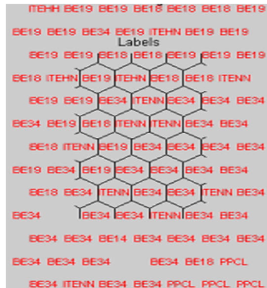
Figure 3. A snapshot of clustering of right ear hearing aids from right ear air conduction frequencies.

SOM and k-means are complimentary techniques in that SOM gives a visual way of looking at individual patients while k-means finds the prototypical members of clusters of similar patients such as those with similar audiograms. In SOM we labeled each patient record by a single word such as hearing aid type, while the clusters produced by k-means are labeled using the chi-squared technique with number of keywords. However, exactly the same techniques could be used in both.